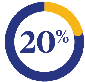
average retail gym membership savings with One Pass Select 3

Half of U.S. consumers report wellness as a top priority in their daily lives. 1 One Pass Select™ is designed to help make it easier for your employees to prioritize their health and wellness through a lower-cost, extensive nationwide gym network—including digital fitness. Best of all, your employees have the freedom to choose the option that fits their needs and lifestyle.